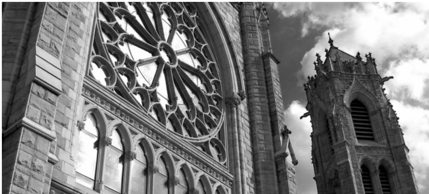
New Work 3D offers a rare glimpse of one of America's oldest cities as seen by two artists who live there.

'67 and The Rule - two social justice documentaries they've produced together. Recently, their film New Work 3D - a unique portrait of Newark, presented in 3D - has been given a home at a very unlikely venue: Newark Liberty International Airport.