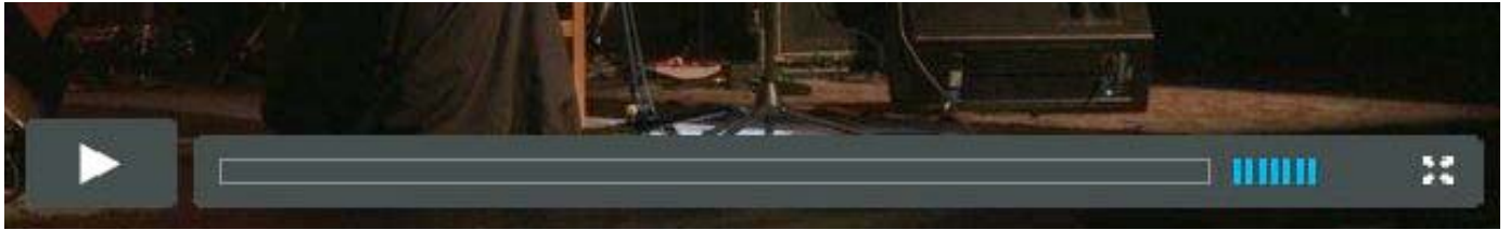
The Cowboy Junkies at SOPAC.

This time on State of the Arts , we look back on the life and career of one of New Jersey's most famous poets, Amiri Baraka, who died earlier this year. He was New Jersey's last Poet Laureate, and his talent for walking the line between art and activism made him into an American icon. Over the years, he appeared on State of the Arts many times. In this segment, we look back on some of our conversations, as well as some of his performances, from our archive.