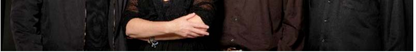
Cowboy Junkies: siblings Margo, Michael, and Peter Timmins, with bassist Alan Anton.