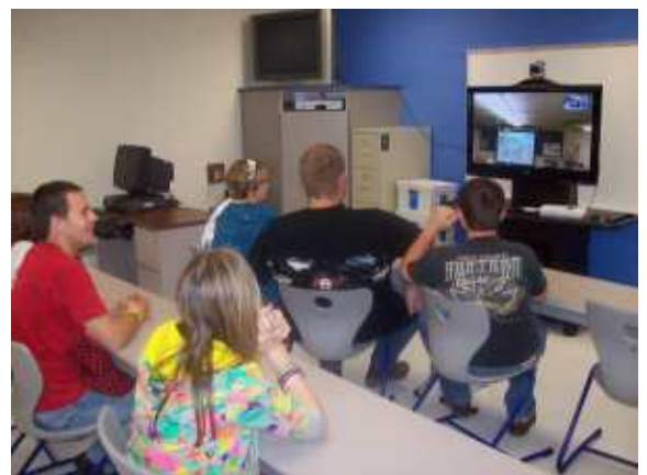
WHS Media Tech students participating in a live video conference .